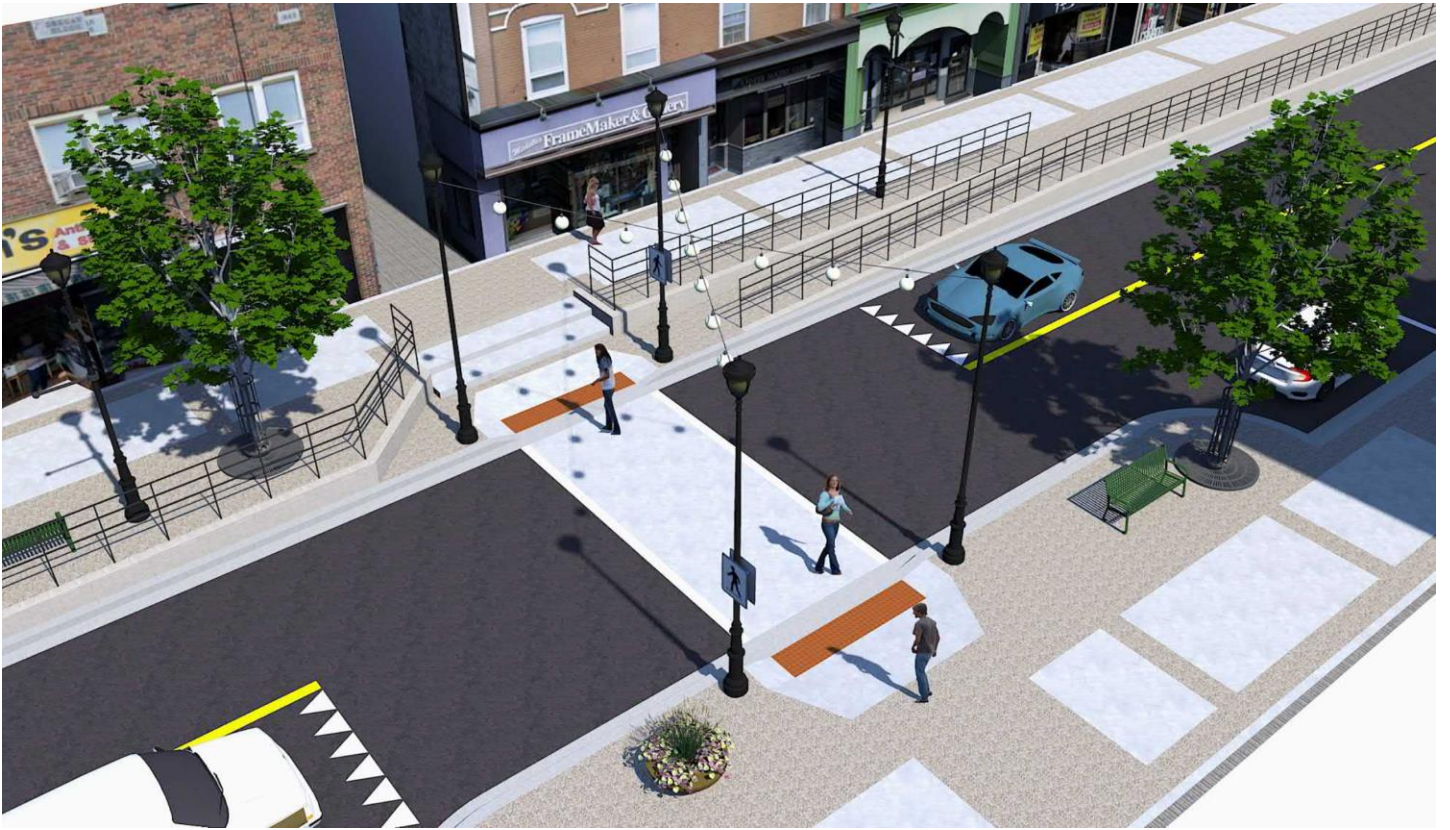
Main Street West, near the intersection of Fraser Street