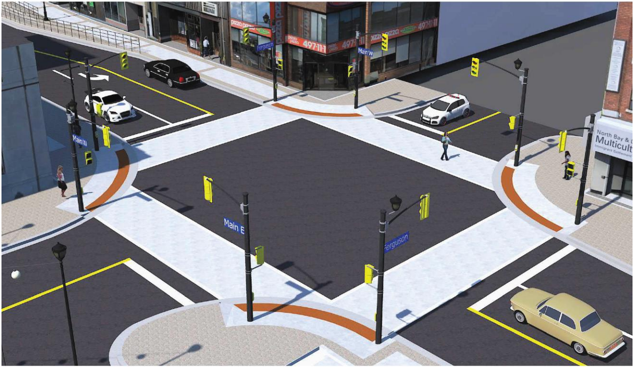
Ferguson Street and Main Street Intersection (typical layout of intersections throughout the project)