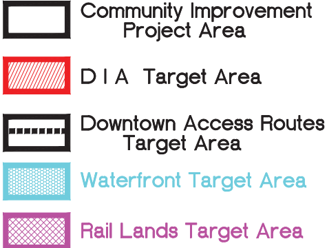
DIA Target Area

TO INTERSECTION OF LAKESHORE DRIVE AND HWY. 11