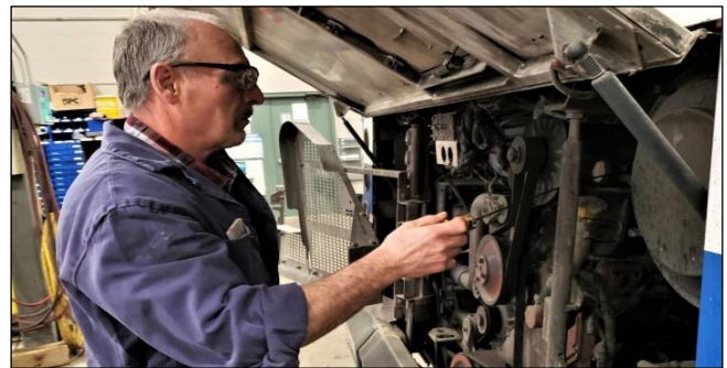
EQUIPMENT USAGE UP 50% - 75% THIS WINTER

In addition to assisting with winter maintenance, Parks Staff oversaw a successful outdoor rinks program this year. Staff and volunteers were able to keep all 11 rinks open for 13 weeks. Staff, typically try to have rinks open for the Christmas break and aim to keep them operational for approximately 10 weeks. This winter was the first time in years rinks were fully operational during March break