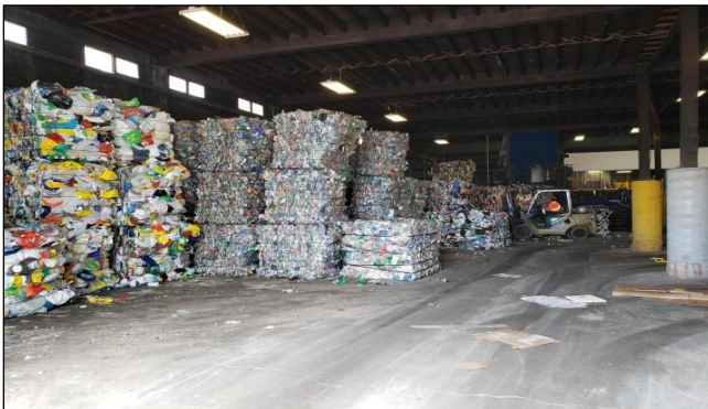
NORTH BAY RECYCLING FACILITY

Corporate Business Intelligence software has been installed – that once fully implemented – will allow departments such as Finance to leverage corporate data for reporting and decision making.