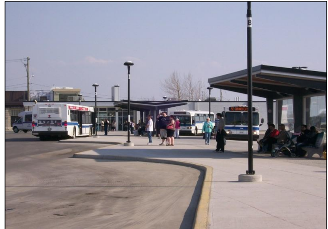
NORTH BAY TRANSIT TERMINAL

Download North Bay Recycles from the App Store for iOS, Google Play for Android.