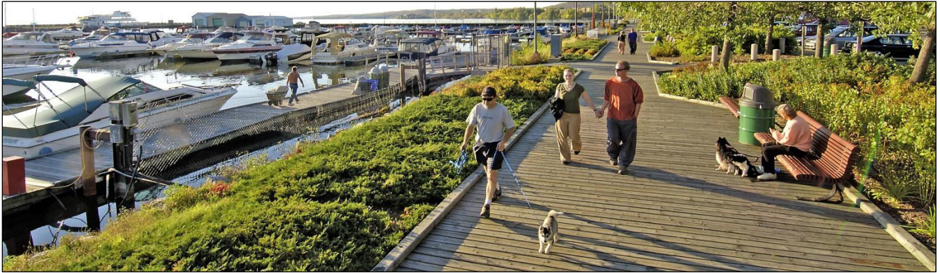
NORTH BAY WATER FRONT