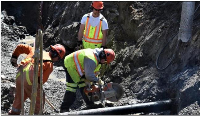
LAVASE ROAD PROJECT