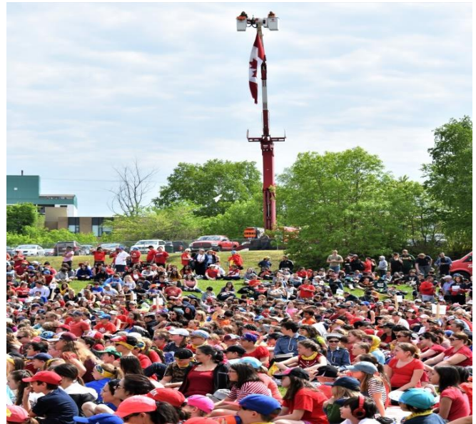
NORTH BAY ARMED FORCES DAY