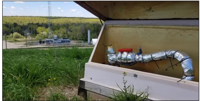
GAS COLLECTION AT THE LANDFILL WILL BE EXPANDED

“$1 million will be invested in the City's recreational facilities.”