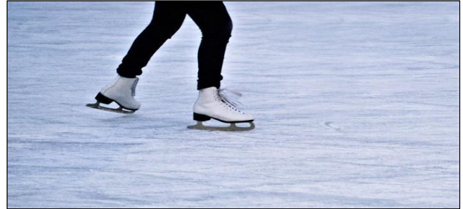
RINKS OPERATED FOR 13 WEEKS THIS WINTER

“Only 20 calls this winter for frozen water services.”