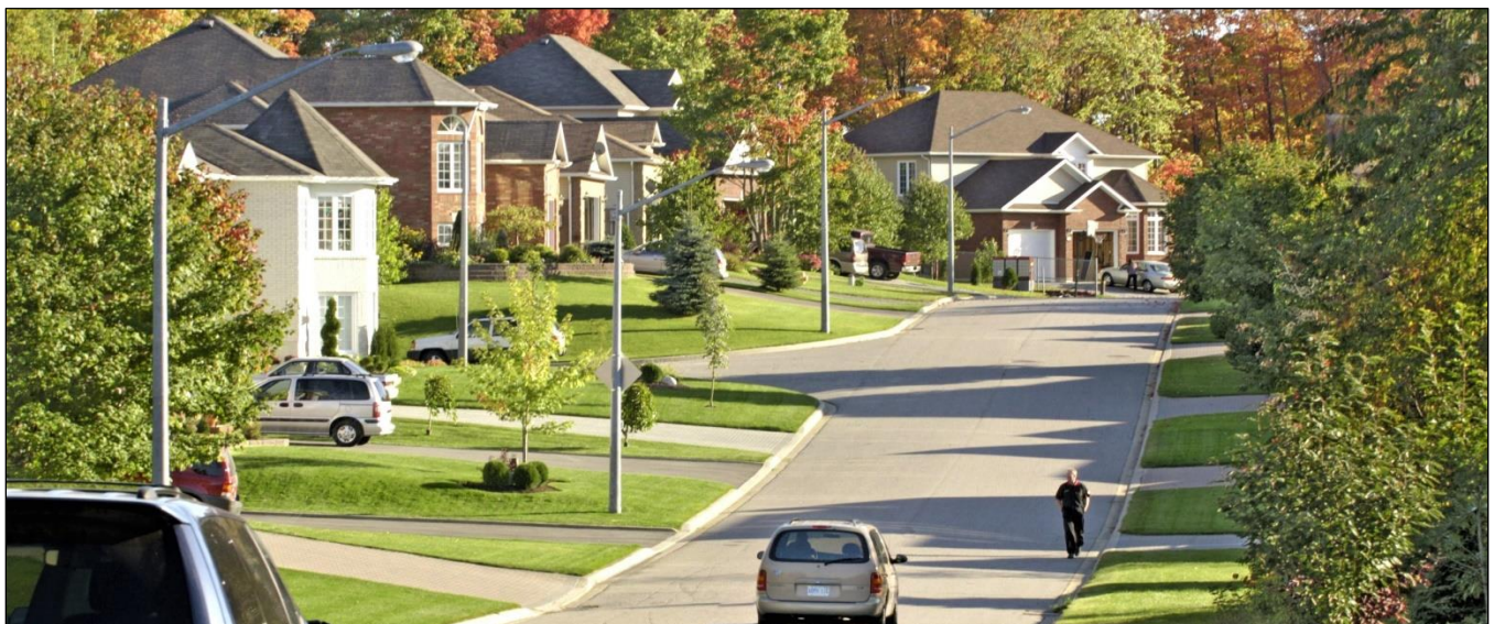
NORTH BAY NEIGHBOURHOOD