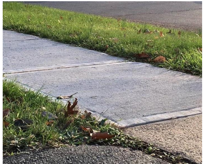
FINAL PHASE OF GREENHILL PROJECT TO BE COMPLETED

“New sidewalk from Airport Road to Vincent Massey.”