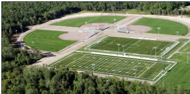
STEVE OMISCHL SPORTS FIELD COMPLEX

The Community Services Business Unit enhances the personal, social, economic and environmental quality of life for our all those in the community, providing recreation programming within parks and facilities. Community services also works with local partners to ensure a strong economic sector for North Bay. It is a key department for the public, providing programs within the community that enrich the quality of life for everyone.