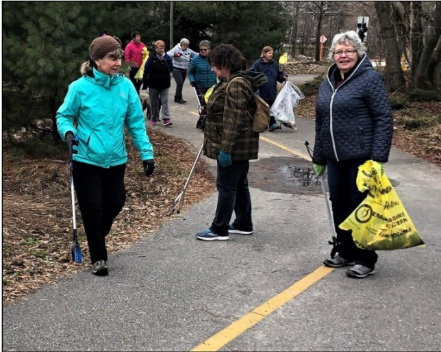
COMMUNITY CLEAN UP