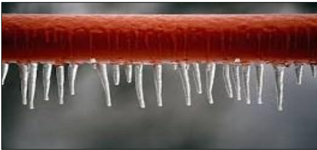
FEWER CALLS FOR FROZEN WATER THIS WINTER

A total of 8,557 loads of snow were removed by Public Works in 2019 compared to 2,268 in 2018 and 3,740 in 2017. That includes 7,623 loads of snow from City roads, 818 from cul-de-sacs and dead ends and 116 loads of snow from the downtown and central area of the City.