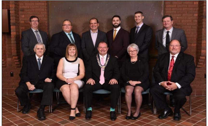
NORTH BAY COUNCIL

This report is snapshot of those efforts. It's been broken down into five sections, including the three business units of the City – Community Services, Infrastructure and Operations and General Government – as well as Capital Projects and Community Partnerships.