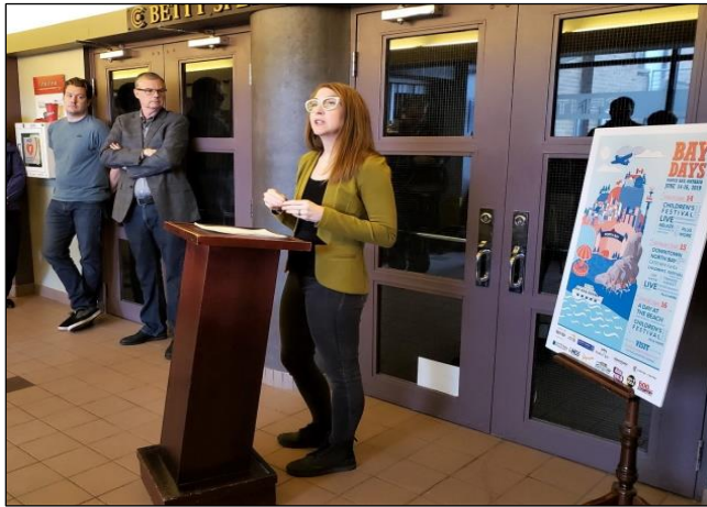
BAY DAYS ANNOUNCEMENT