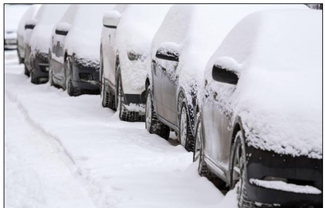
A RECORD AMOUNT OF SNOW KEPT CREWS BUSY THIS WINTER

Parks Staff implemented an ongoing snow removal program in the downtown this past winter in an effort to address repeated concerns from business owners and residents regarding inadequate parking and high snowbanks. The program proved more efficient and cost effective than the past practice of utilizing the Roads Department and contract equipment. This new practice will be adopted going forward and is expected to result in the continued ongoing removal of snow each winter within the downtown business district.