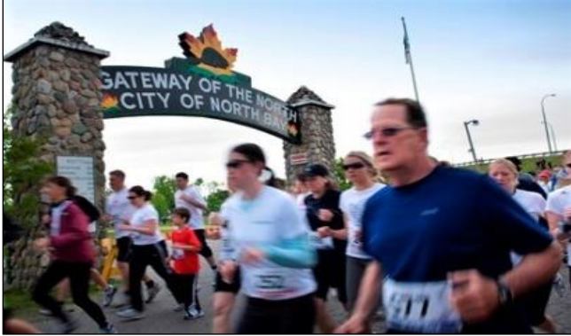
SIDEWALK AND PARK ACCESS IMPROVEMENTS PLANNED