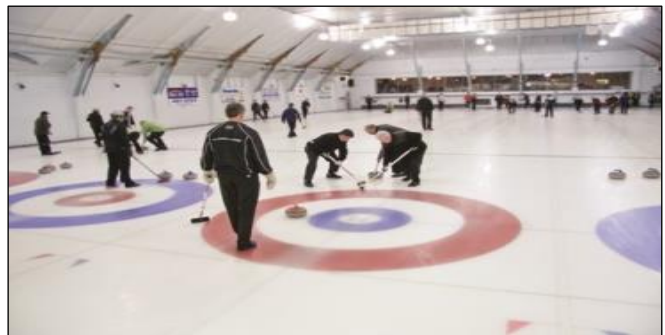
NORTH BAY GRANITE CLUB

The City is investing $40,000 to create a Community Event Hosting Fund to support and encourage local events involving a competitive bids and application process. To date, a total of seven local groups will benefit from this fund.