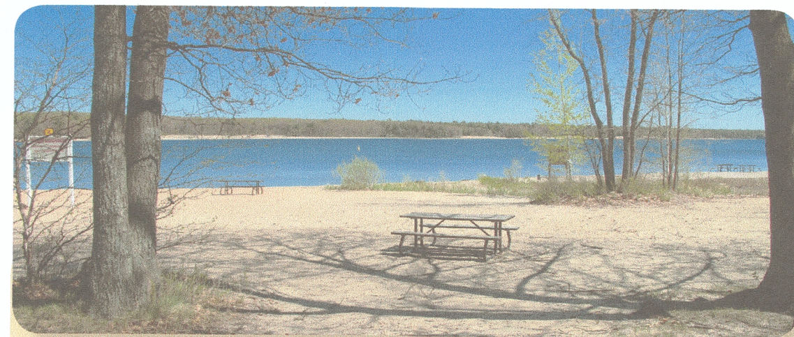
Stop 1: Day-Use area beach on Kilcoursie Bay.

GPS co-ordinates: N45° 20.970', W80° 13.063'