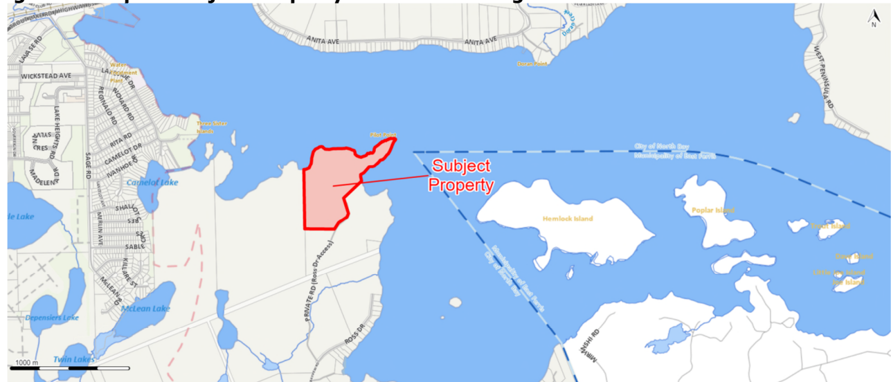
Figure 1: Map of Subject Property and Surrounding Area

The property has an existing lot area of 17.07 hectares and has irregular lot frontage along Trout Lake, as shown on attached Schedule B. The property is currently developed with two existing cottages with some related accessory structures and decks.